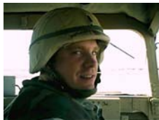
Atheists are in Foxholes

MAAF is dedicated to providing a supportive community for these heroes. As they move from base to base, from port to port, and from ship to ship — MAAF is there to provide like-minded friends and moral support. Secular service members need never feel they are alone in doubting religious doctrines.